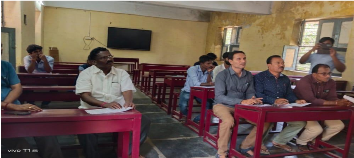
Examiners at CSP Presentations