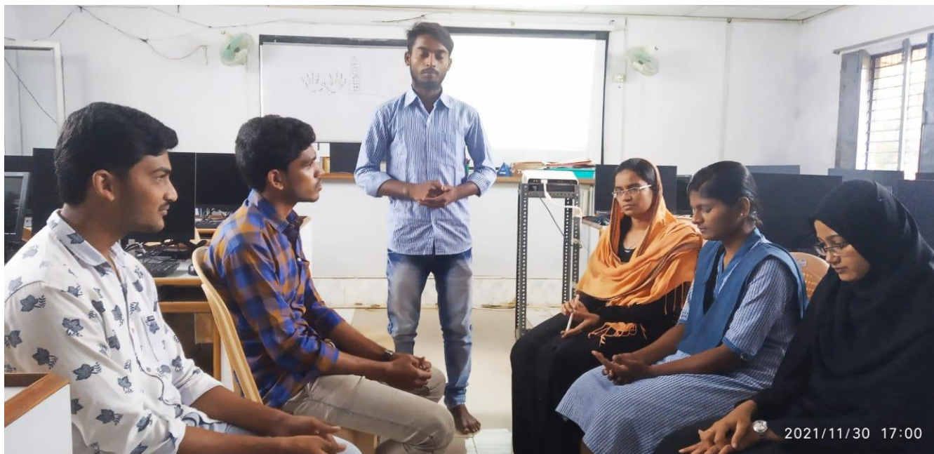
Group Discussion session