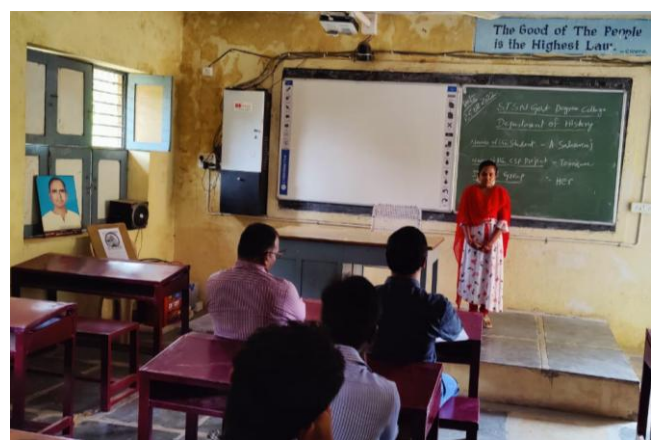
Students Participating in Community Service Project Work - Viva-voce