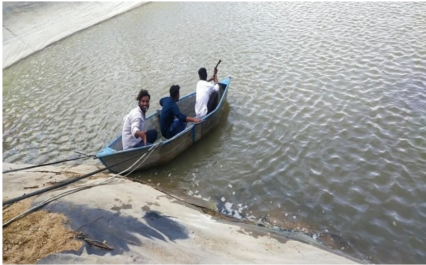
CATCHING OF FISHES BY USING THE BOAT