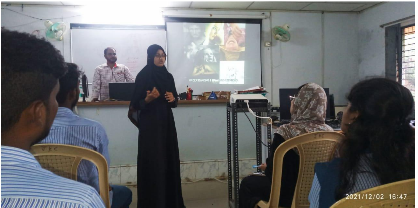
JAM (Just A Minute) Session