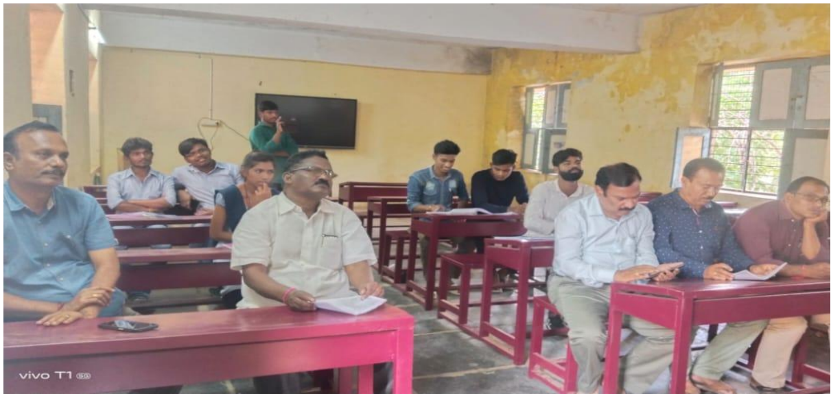
CSP Examiners: Mentors, IQAC, His, Eco, Pol-Sci & vice Principal etc at CSP Presentations