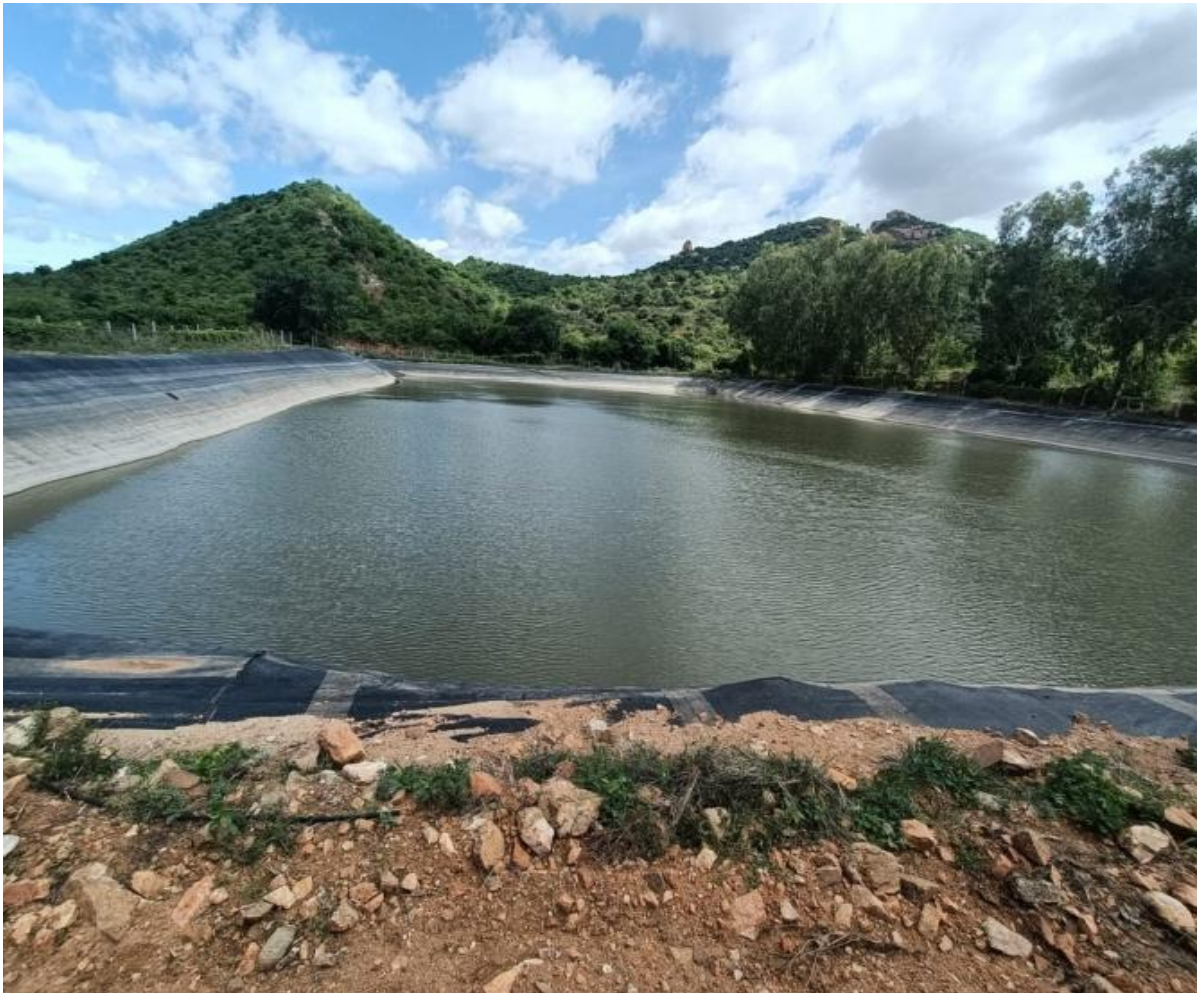
FRESH WATER FISH POND