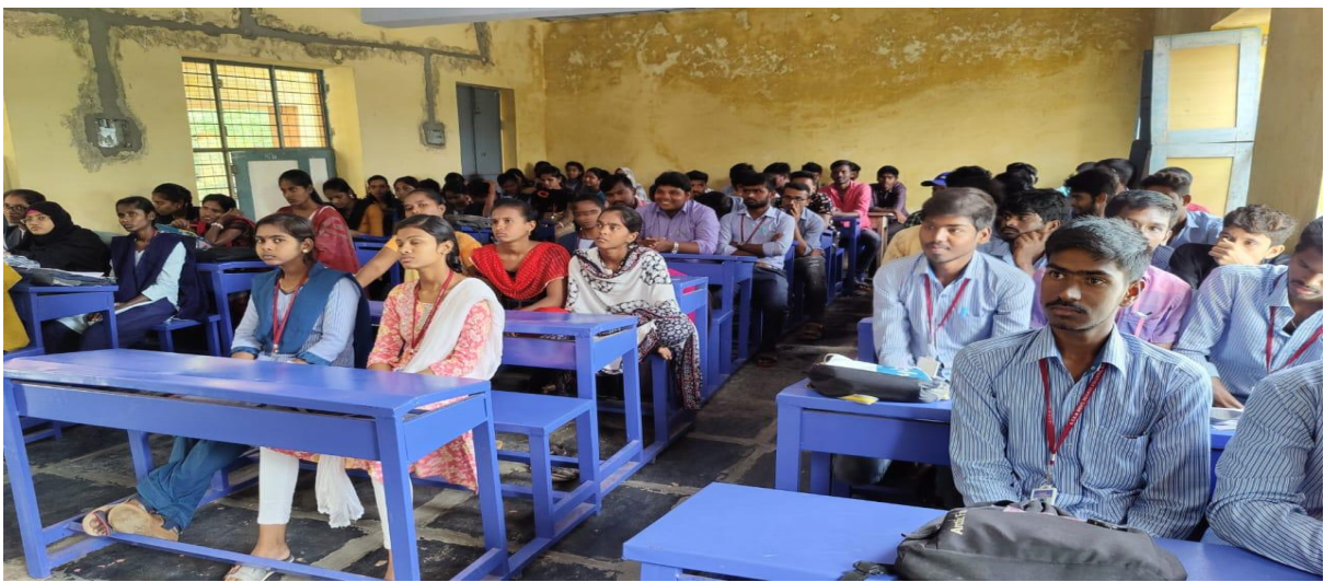
Students at CSP