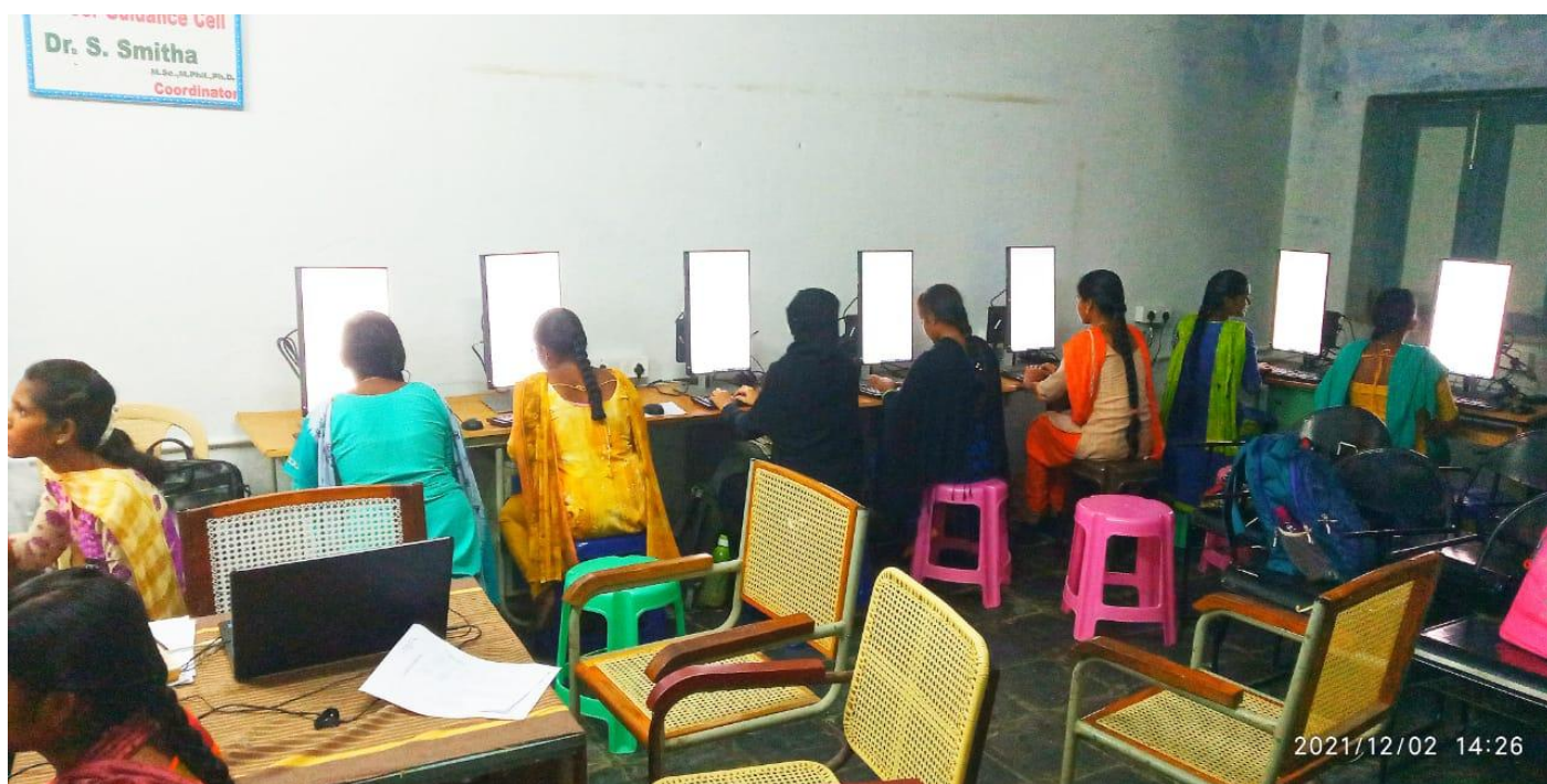
Students participating in Problem solving Method