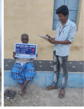
Students Participating in Community Service Project Work