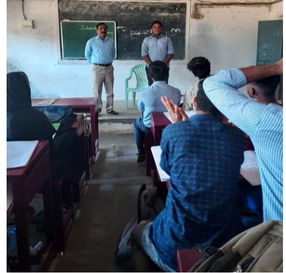
Peer Group Teaching